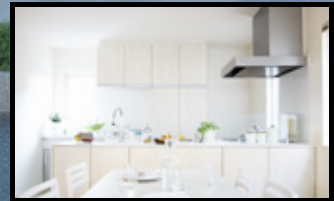
Dining / Kitchen